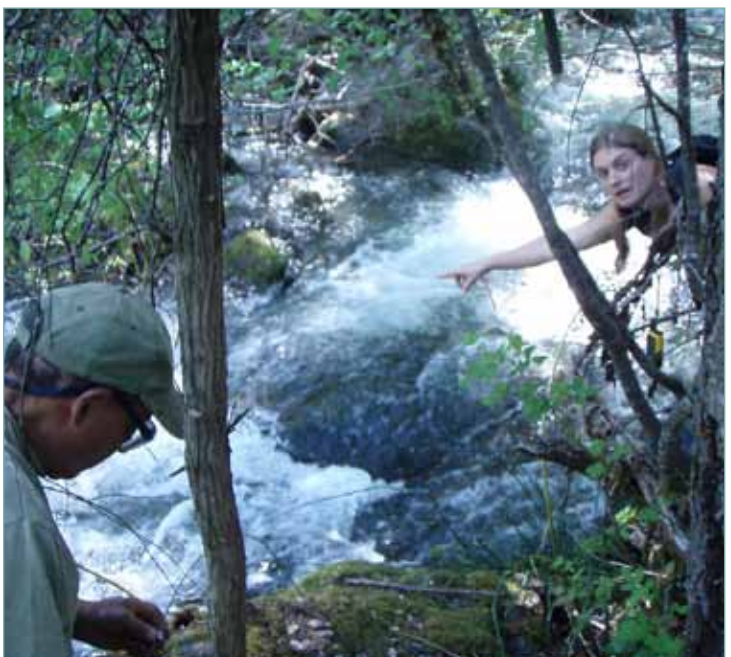
Photo left by Mitzi Rants of a student taking data during a fall Chinook spawning survey.

Water Monitoring: The SRRC and community volunteers monitored water and air temperatures at approximately 50 sites this past summer. In addition to our long term sites, we had a contract with the US Forest Service to help them collect temperature data throughout the watershed for their Klamath National Forest Monitoring Plan. The SRRC has also continued to participate in the collaborative Klamath Basin Monitoring Program to develop and implement a long term monitoring plan for the Klamath and its tributaries, which includes the Salmon River. This program was funded by the US Forest Service and the North Coast Regional Water Quality Control Board.