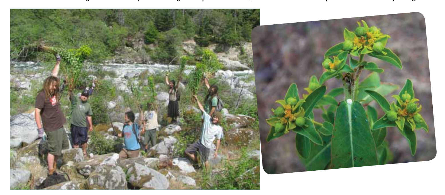
and remove all of the adults plants before they had a chance to seed! Photo above left, Petey's photo shows part of the noxious weed crew and the oblong spurge dug from the river bar.

Noxious Weeds: This year we continued our efforts to control 17 priority noxious weed species on approximately 550 sites throughout the watershed. Our late winter and spring efforts focused on Italian thistle around Forks of Salmon, with great affect. It seems like we are rounding the bend with this wind spread invader; where once there were mats of weeds it is now hard to find any. The crew and volunteers also made huge progress this year in beating back the oblong spurge populations discovered on the Mainstem Salmon last year. This new species (photo below right) is particularly difficult as the main population is across the river and it drops seeds in the late spring while the water is still high. Thanks to help from rafting and kayak enthusiasts, crews were able to ferry across the river despite high water