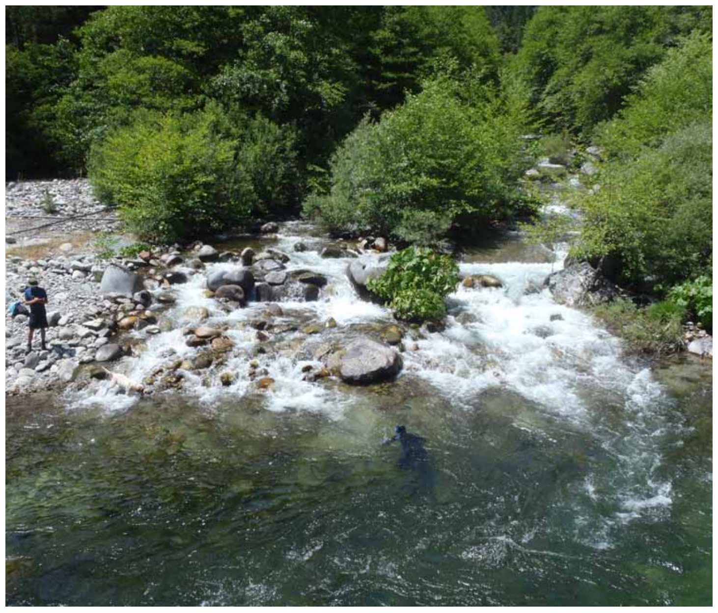
Creek Mouth Enhancement crew looking for fish at the mouth of the Little North Fork