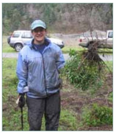
Noxious weeder holding up one of the thousands of oblong spurge plants dug from private land on the Klamath River.